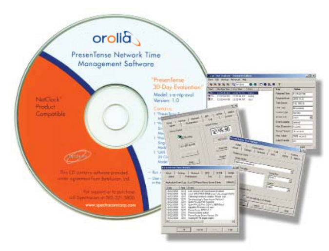
NetClock® Product Compatible

Complete Management Solution for Network Time Synchronization