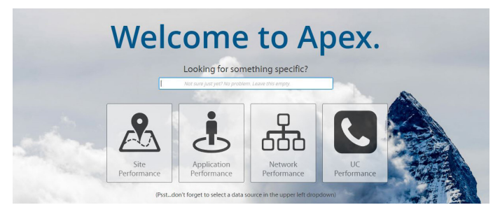
Apex welcome page with powerful search functionality offers predefined workflows