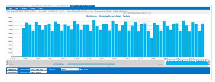
GigaStor reduces troubleshooting time through simplified time-based navigation to anomalous traffic