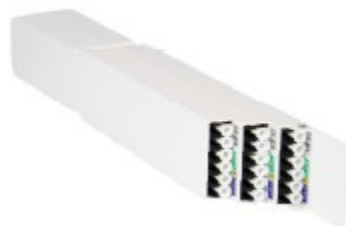
Flex Tap VHD