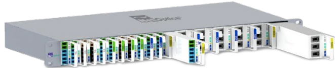
Ixia Flex Taps in RK-FLEX-24 Rack