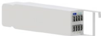
Flex Tap BiDi