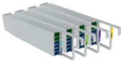
Flex Tap LC