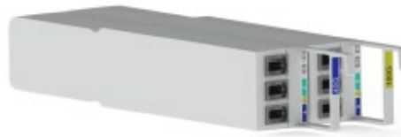
Flex Tap MTP