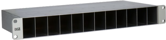
Assembly Rack Chassis – RK-Flex-24