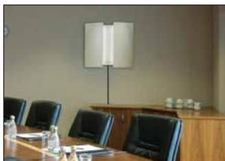
Decorative cover is ideal for use in conference rooms and office spaces

GPS signals are weak and often impractical in urban environments due to limited visibility of the sky, and constraints of roof-top access and long GPS antenna cable runs. SkyLight is a result of Spectracom’s expertise in GPS reception and applications for precision timing. Proprietary algorithms use a combination of high sensitivity receivers, accurate internal oscillators and other techniques to extract the GPS on-time point to sub-microsecond accuracy even in areas with somewhat limited GPS reception.