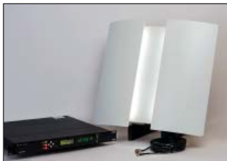
Skylight includes indoor GPS antenna panel, RG-58 cable, and SecureSync GPS time Server

Even though synchronizing network master clocks and time servers to GPS is well-known as the standard for the most time-sensitive applications, some data centers and critical server locations are not conducive to traditional roof-top GPS antenna installation. SkyLight™ provides a solution. Consisting of an indoor GPS antenna panel, a configuration of Spectracom’s SecureSync® modular GPS time server, and an interconnect cable, SkyLight opens new possibilities for accurate GPS time.